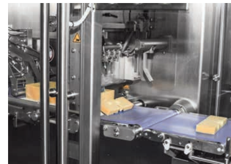
Food and beverage