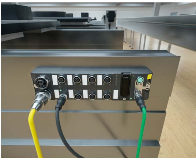
Connecting up to 32 bus-capable read/write heads on one RFID channel

The cabling is implemented here in a line topology, so that the system can be installed and extended easily. Each of the 32 read/write heads can be addressed individually in HF bus mode in order to execute a wide range of commands such as the read, write or inventory commands. The read/write heads can be addressed both manually as well as automatically. In an exchange between individual read/write heads, addressing is carried out automatically in ascending order according to the order of connection. Thanks to the minimal use of modules and cables, the user not only benefits from cost savings but also from shorter mounting and commissioning times.