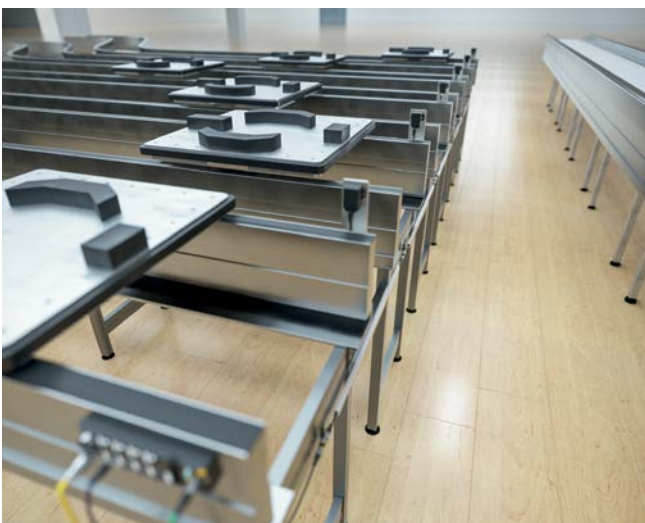
Simultaneous identification of tool carriers on parallel conveyor lines

HF bus mode is already being used successfully in applications, such as the identification of printer ink cartridges. In this application, the tanks are identified automatically by the read/write head in order to reliably prevent faulty print results and production downtimes. The system can also remind operators to change an ink in time. The system determines the timing of the message according to the time when the ink cartridge was fitted and its expiry date. The current ink consumption is used to approximate the level of each individual tank. The main applications for the HF bus mode therefore cover tool and format changes, as well as the brand protection of tools.