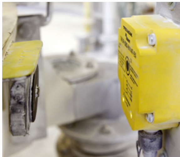
An Ex read/write head reads out the mesh width of the screen from the tag on the screen (left)